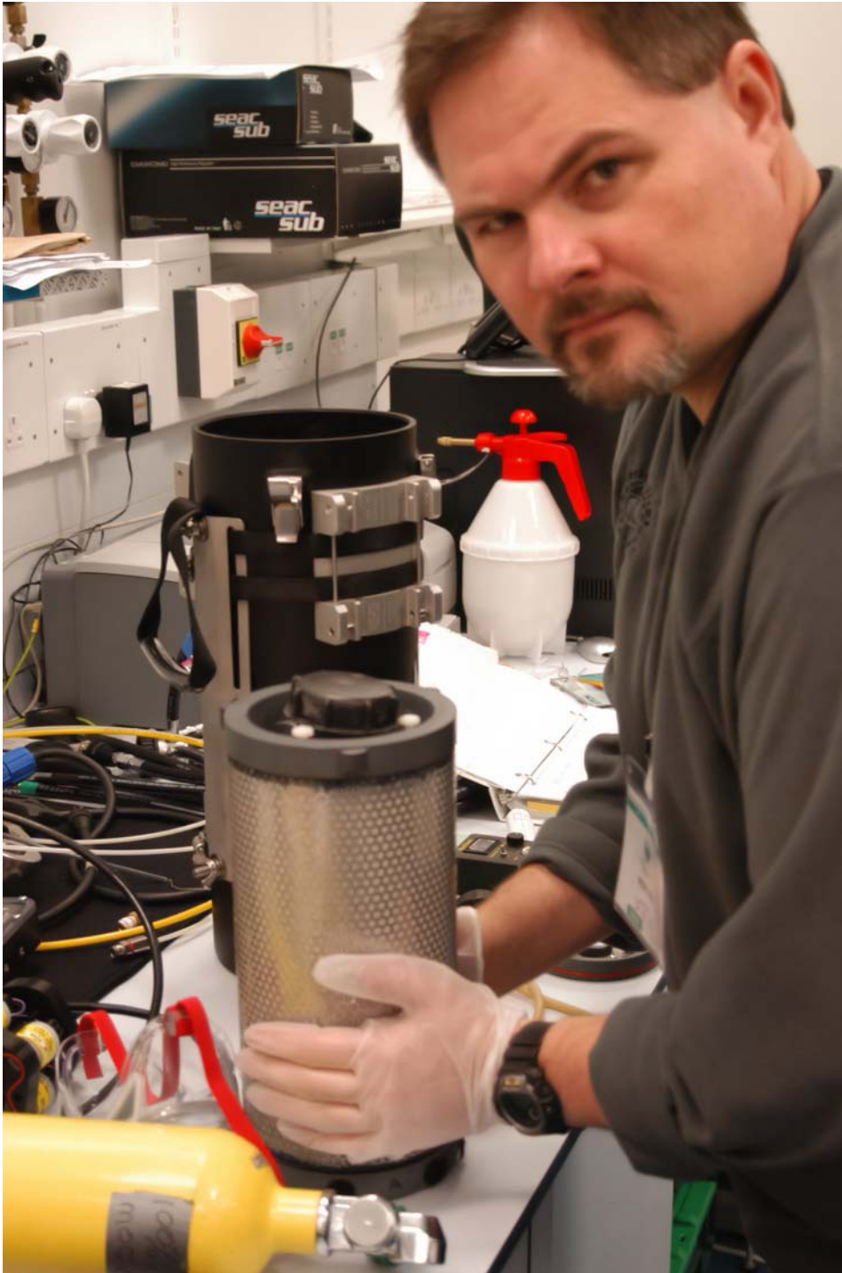
Photo 7 - Cis Lunar Scrubber Packing - Fits MEG